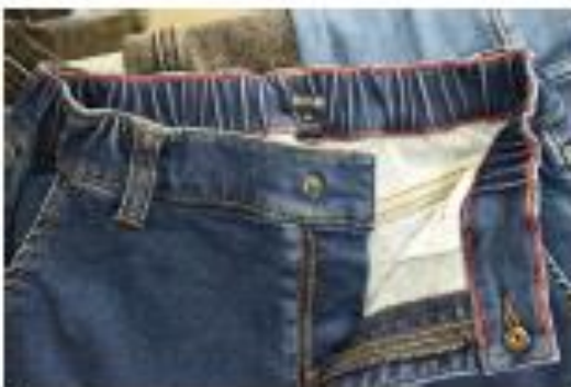
INNER WAIST CONTRAST CHAIN STITCH