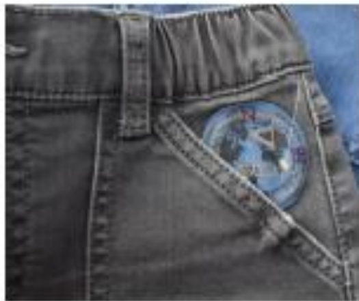
WOVEN PATCH LABEL AT FRONT