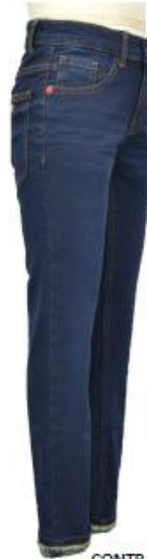
CONTRAST OVERLOCK STITCH AT HFM