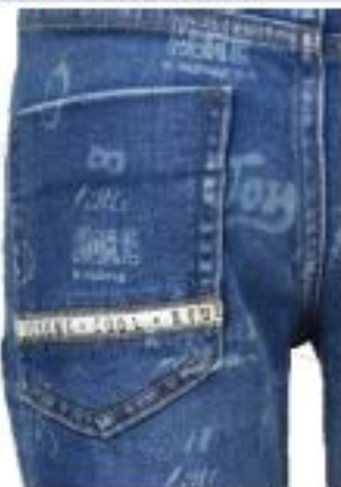
PRINTED TWILL TAPE