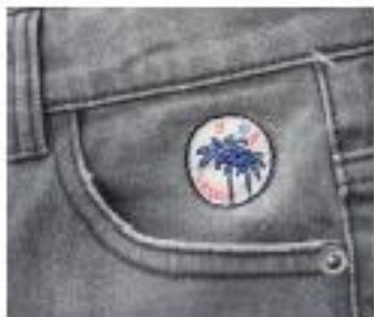
WOVEN PATCH LABEL