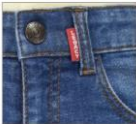
FLAG LABEL AT FRONT LOOP