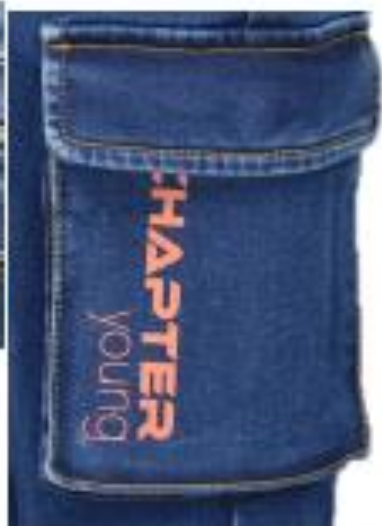
HEAT TRANSFER LABEL