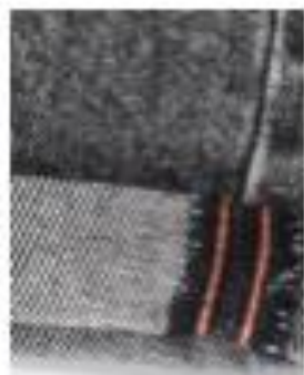
CONTRAST CHAIN STITCH