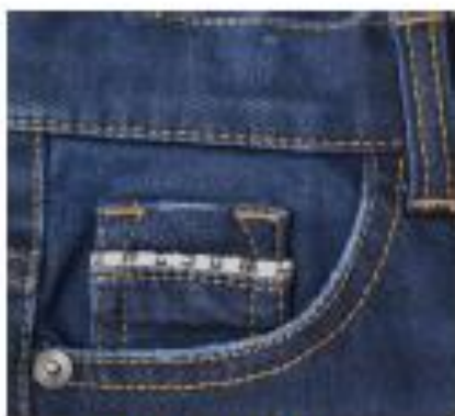
PRINTED TWILL TAPE ON COIN PKT