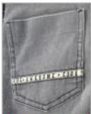
PRINTED TWILL TAPE