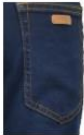
FAKE LEATHER PATCH AT BK PKT