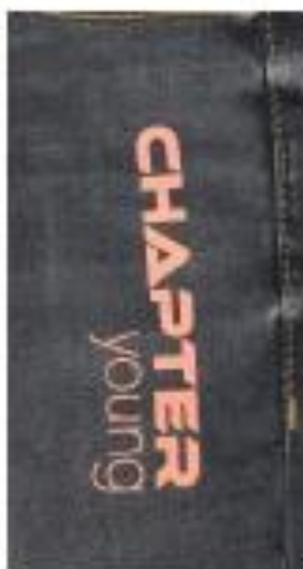
HEAT TRANSFER LABEL