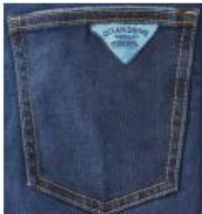
WOVEN PATCH LABEL AT BK PKT