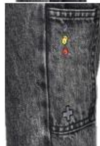
HEAT TRANSFER LABEL