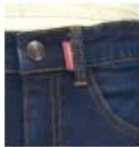
FLAG LABEL AT FRONT LOOP