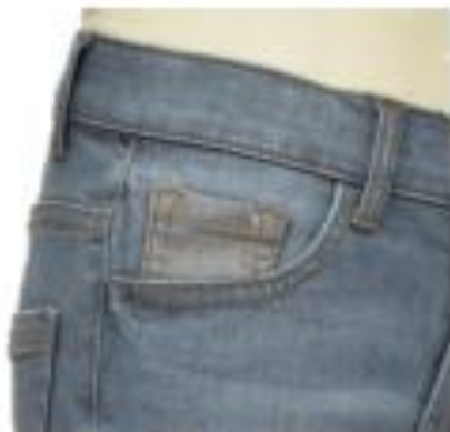
REVERSE FABRIC IN COIN PKT