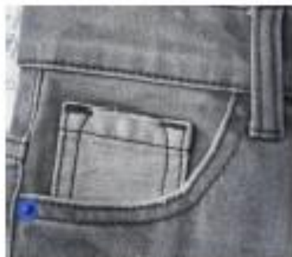
REVERSE FABRIC IN COIN PKT