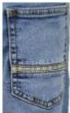
TWILL TAPE DETAILING AT RIGHT BACK PKT