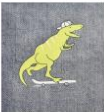
HEAT TRANSFER LABEL