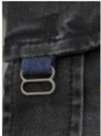
METAL D-RING AT CARGO PKT