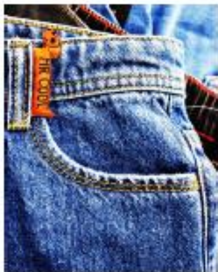
FANCY FLAG LABEL AT FRONT LEFT B.LOOP